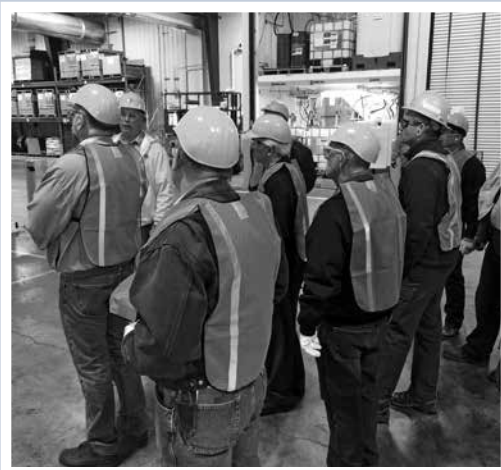
Directors touring Pioneer Plant in Good Hope ▶