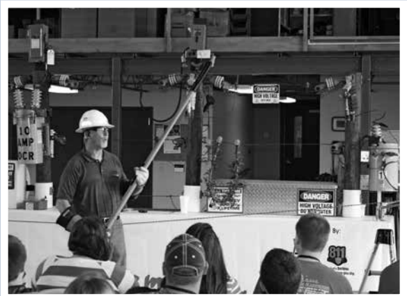
▲ Illinois Cooperative Council Youth Conference - Live Line Demo